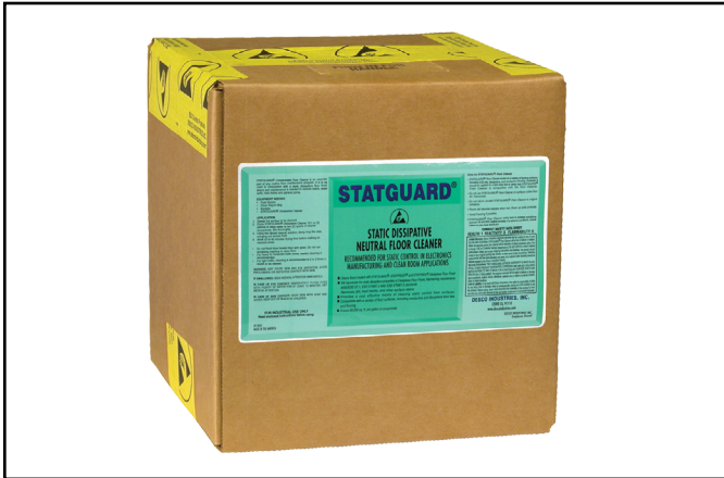
Figure 1. Statguard® Dissipative Neutral Floor Cleaner