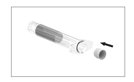
2. Place the piston into the syringe barrel.