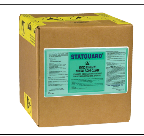
Figure 1. Statguard® Dissipative Neutral Floor Cleaner